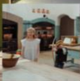
Step back in time with The Servant School at Raby Castle