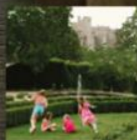
Seed Sowing in the stunning Walled Gardens