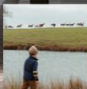
Spot the majestic Deer roaming in the picturesque parkland