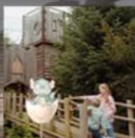
Explore The Plotters' Forest Dragon Quest